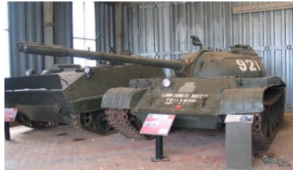
A Type 59 tank, in use during the Vietnam War.

Currently, the Vietnamese main battle tanks (MBTs) are all legacies from the front part of the Cold War, T-54/55s, T-62s, and Type 59s. In contrast, the PLA has modernized its MBT units with Type 88, Type 96, and Type 99, one or more generations ahead of the VPA's, reflecting greater firepower, mobility, and protection. Although Hanoi introduced Israeli technologies to upgrade its T-55 MBTs, the generation gap was not fully overcome. In other words, an armor battle between China and Vietnam would favor the former.