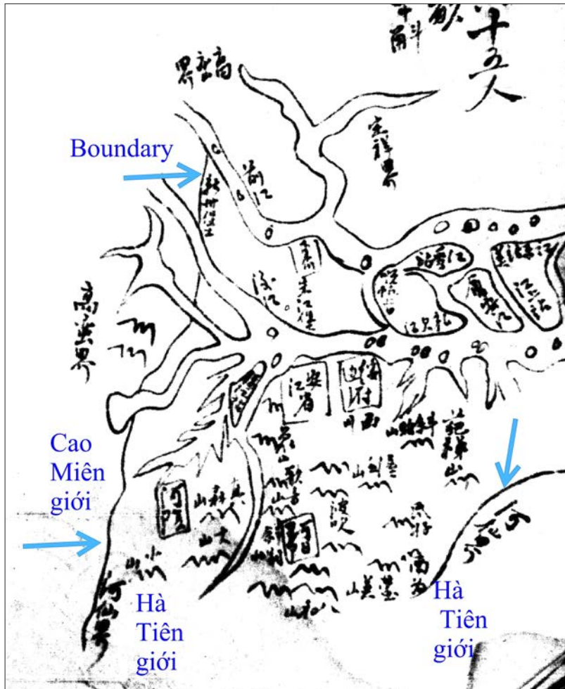
MAP 3. Map of An Giang Province. Source: Đại Nam Nhất Thống Dư Đồ (1861b, EFEO microfilm, A. 1600, 76a).

simply to avoid conflict among the Western powers (2001, 44). Such a perspective, while acknowledging the role of Western institutions, underestimates local factors. I argue that this new cartographical element predated the introduction of Western map-making techniques and was a response to the need for frontier management. 54