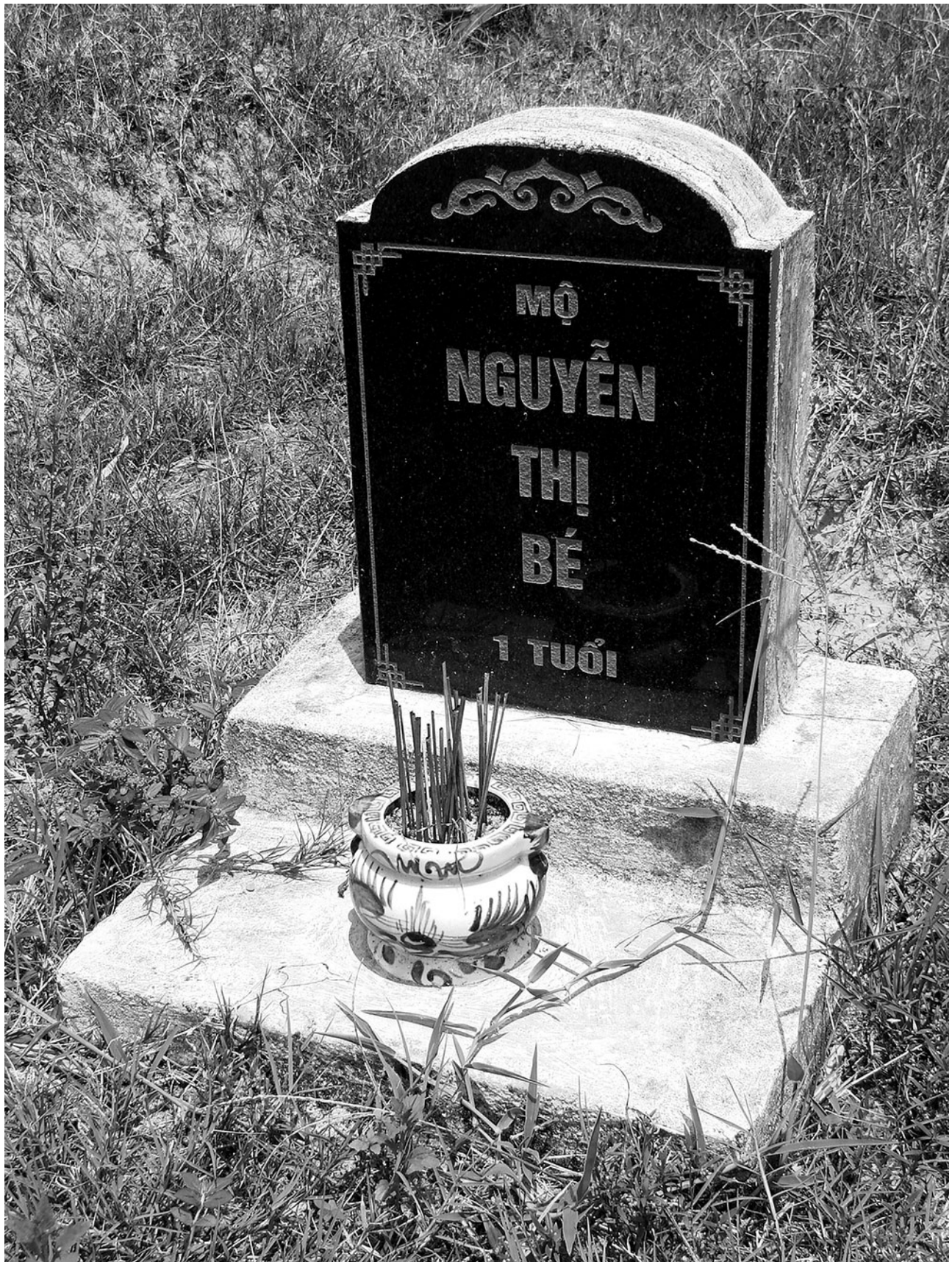
Grave of a one-year-old victim of the My Lai massacre.